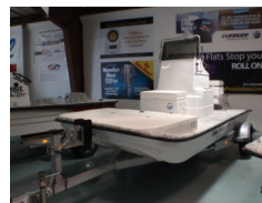
A 2012 Skooter 136 will be raffled Saturday after the Tournament!

Reference the Dargel Boat Owners Tournament!